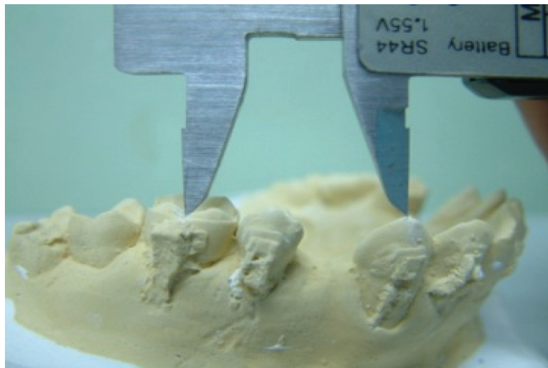
FIGURE 2. Measurement of the distance for canine retraction

Damon™ 3 SLB were analyzed by unpaired student's t-test. The criterion for statistical significance was considered to be p < 0.05 .